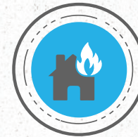
Fire and allied perils Insurance