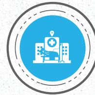
Medical/ Health Insurance