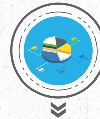
Bankers Blanket Bond

Our business model is client focused since our clients are placed in the heart of our attention because they are the backbone of our business philosophy. We strive to foster long term relationships with our clients and we are continuously aware of their expectations from us.