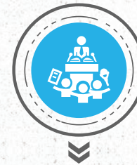
Political Violence and Terrorism